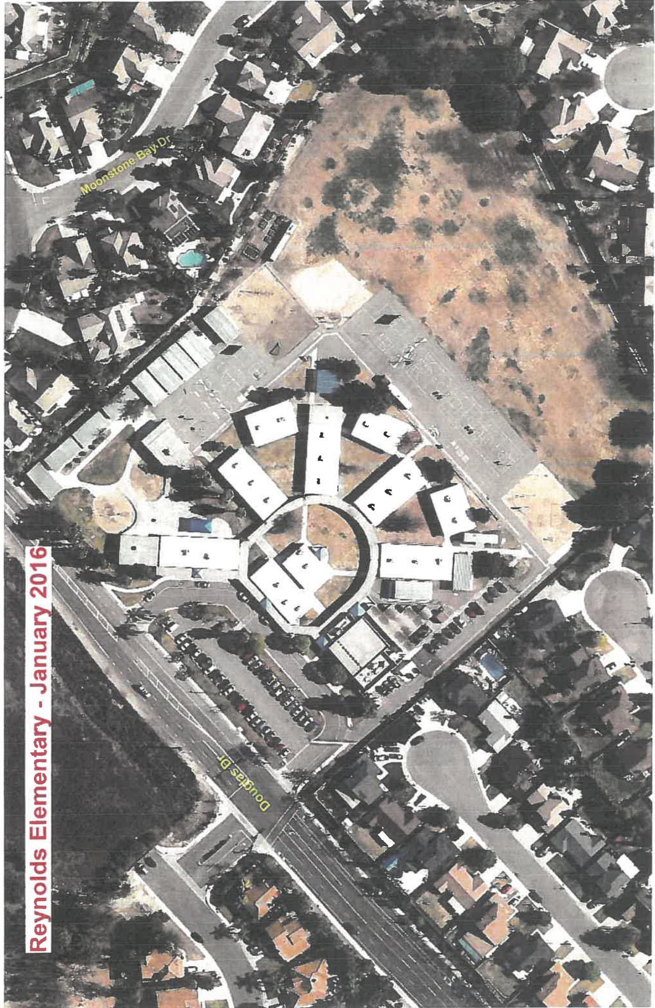
Reynolds Elementary - January 2016